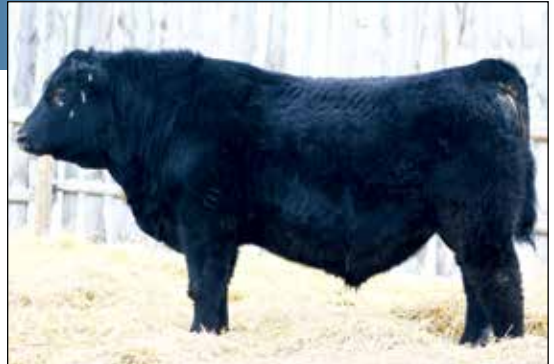
Consigned by: AJ Angus