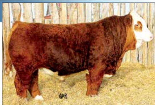
Consigned by: Bar Diamond Cattle

CE: 3.8 BW: 5.7 WW: 77.4 YW: 113.4 Milk: 33.4