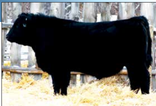
Consigned by: AJ Angus