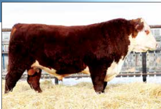
Consigned by: R&L Heather Polled Herefords

BW 89 lbs Purebred. Polled. R&L 27E Gambler 132G is another Ribeye Bull and out of 95Z, a top producing cow. 132G is a deep well-muscled bull with a 89lbs birth weight. He should make a great herd sire.