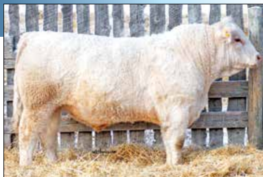
Consigned by: Swistun Charolais