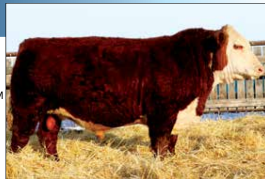
Consigned by: R&L Heather Polled Herefords

BW 85 lbs Purebred. Polled. R&L 27E Grazer 128G is out of our Ribeye Bull and a Mutumbo cow. 128G has a 85lbs birthweight. He is an easy keeping bull with tons of volume.