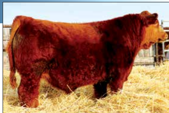
Consigned by: Double R Simmentals

CE: 9.7 BW: 3.0 WW: 79 YW: 111.5 Milk: 25.8