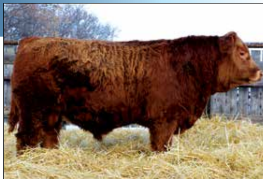
Consigned by: Double R Simmentals

CE: 7.6 BW: 3.1 WW: 77.2 YW: 105.4 Milk: 27.8