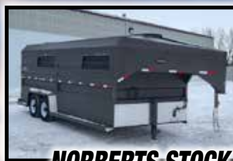
NORBERTS STOCK-TRAILERS AVAILABLE

Check out our large selection of not only stock/horse trailers, but flat deck, dump, enclosed car/sled trailers and utility trailers!