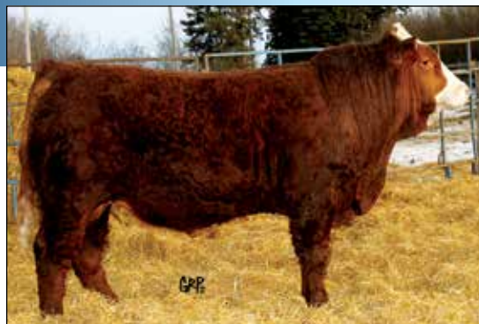
Consigned by: Bar Diamond Cattle

CE: 9.7 BW: 3.8 WW: 75.2 YW: 105.1 Milk: 36.9