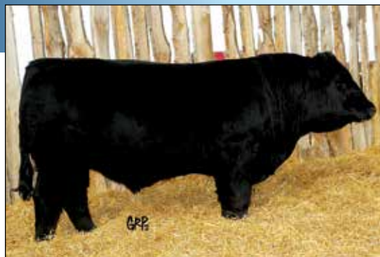
Consigned by: Bar Diamond Cattle

CE: 6.4 BW: 5.1 WW: 87.8 YW: 133.9 Milk: 26.1