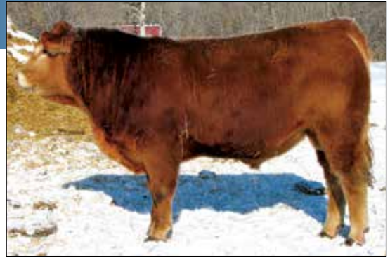
Consigned by: Lazy A Limousin

CED: 3 BW: 6.2 WW: 66 YW: 94 Milk: 30 DOC: 12