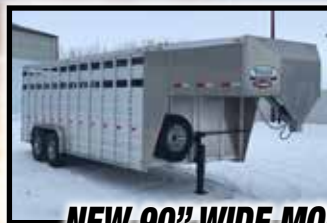
NEW 90" WIDE MODELS NOW AVAILABLE