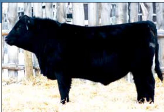
Consigned by: AJ Angus

AJA 035H is sired from our Motive son out of a Net Worth cow. This cross makes for a hairy, well muscled, soft hided animal. 035H has good feet. Recommended for heifers and cows.