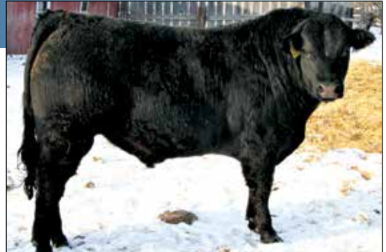
Consigned by: Lazy A Limousin

CED: 11 BW: 3.0 WW: 71 YW: 105 Milk: 18 DOC: 11