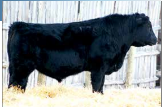
Consigned by: AJ Angus