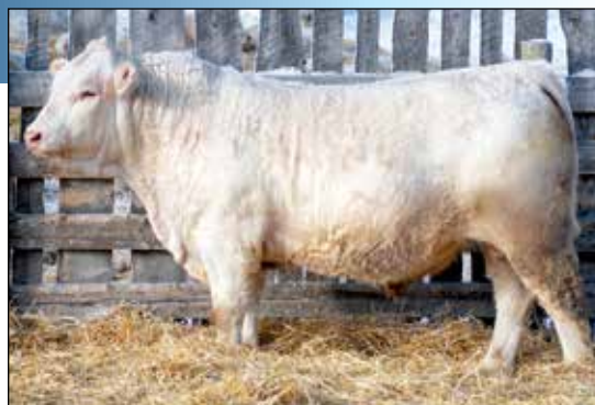
Consigned by: Swistun Charolais