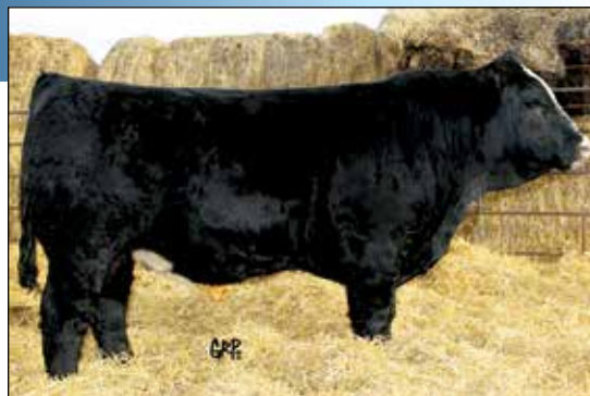
Consigned by: Bar Diamond Cattle

CE: 8.5 BW: 4.1 WW: 82.5 YW: 114.0 Milk: 21.9