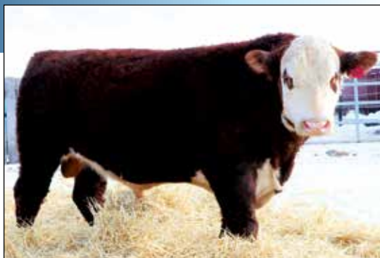
Consigned by: R&L Heather Polled Herefords

BW 95 lbs Purebred. Polled. R&L 27E Gamer 98G is out of our Ribeye Bull and an excellent young cow. 98G has a 95lbs birthweight. He is a smooth correct bull with extra pigment.