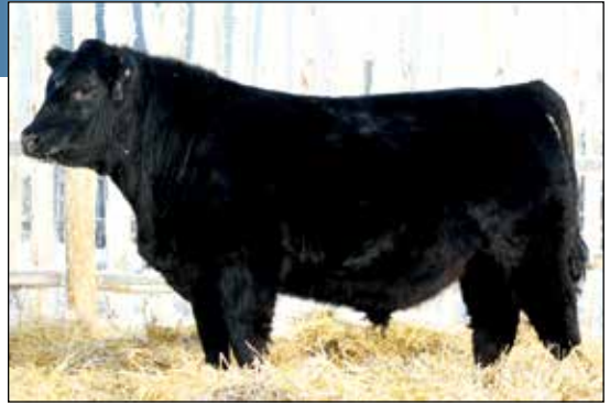
Consigned by: AJ Angus